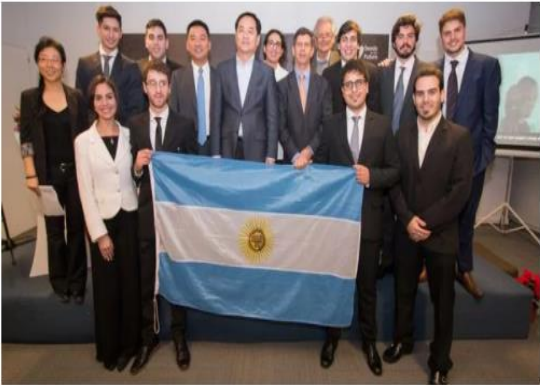
Los 10 jóvenes argentinos seleccionados para formar parte del programa Semillas para el futuro tienen entre 23 y 27 años.